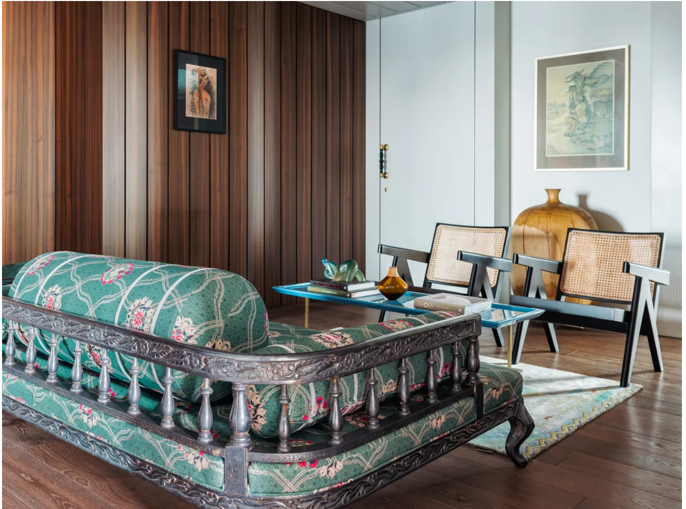
In the smaller family room upstairs, a custom-made silver divan is juxtaposed against two Pierre Jeanneret easy armchairs by Phantom Hands.