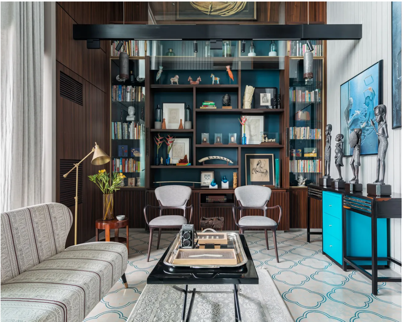
In the double-height ceiling family room, a sheet of glass spanning 10 X 12 feet moves up and down with a weight mechanism designed by Kiran Gala to cover the niches within the wall. A collection of keepsakes and statement pieces from travels over the years have been placed around a set of armchairs by Ceccotti Collezioni.