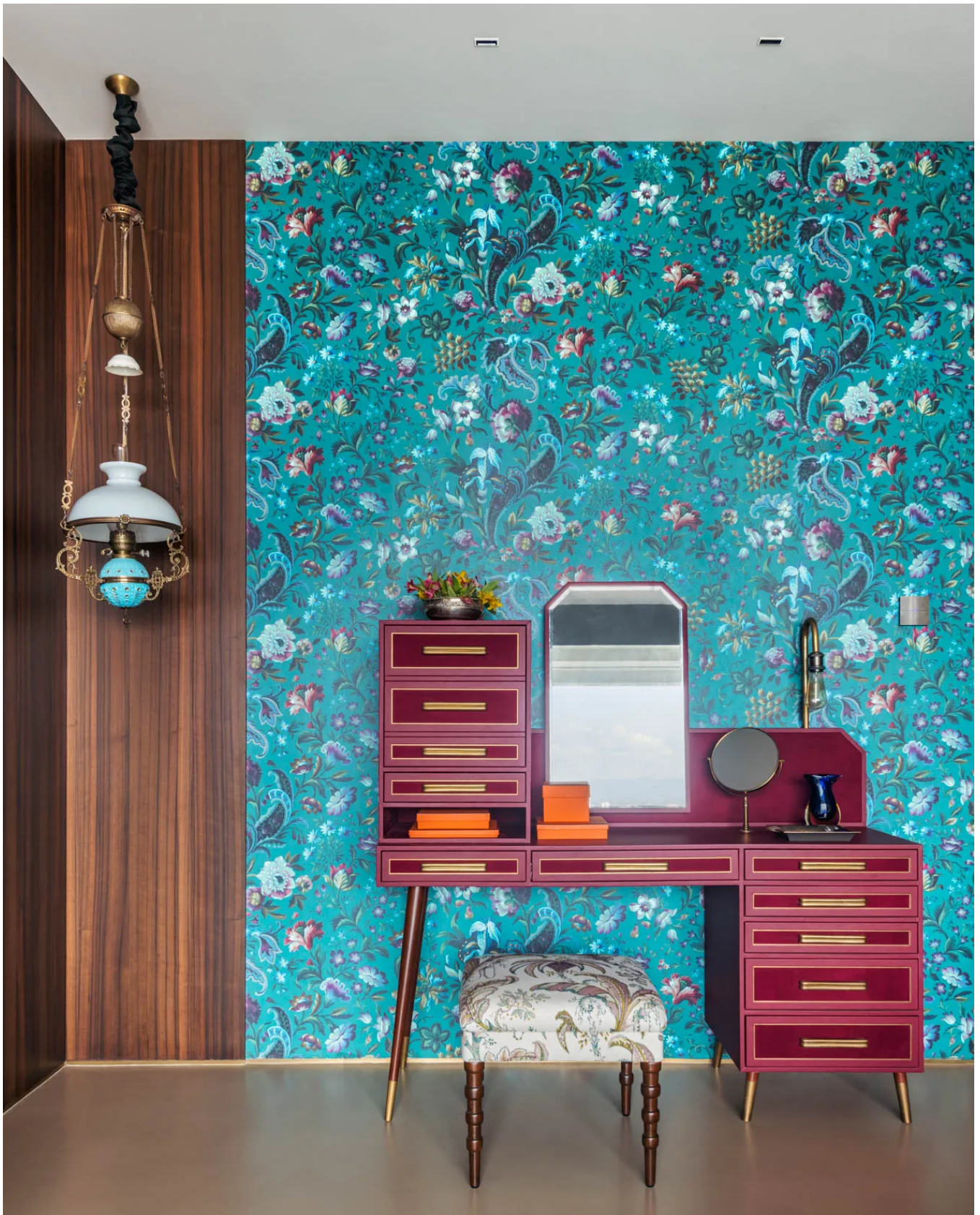
The dresser unit in the main bedroom downstairs has been custom-made by Trunks Company. The antique light to its left by Taherally's complements the House of Hackney wallpaper in the background.

While a part of the collection was bought during travels overseas, most of the furniture in the apartment is custom-made in India. As you'll begin to notice a quiet story unfold in every corner of each room, you'll wonder how one would begin to pair such an intricate collection across such a large space. "Everything came