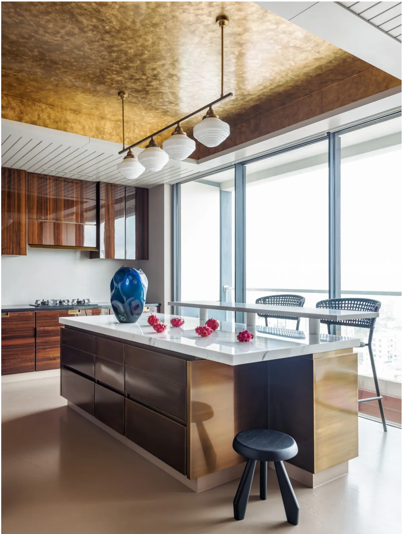
The countertop on the kitchen's island is clad in Statuario marble, while the shutter fronts beneath are fitted with brass metal sheets. An antique set of lights have been custom-made into a modern chandelier by Taherally's.