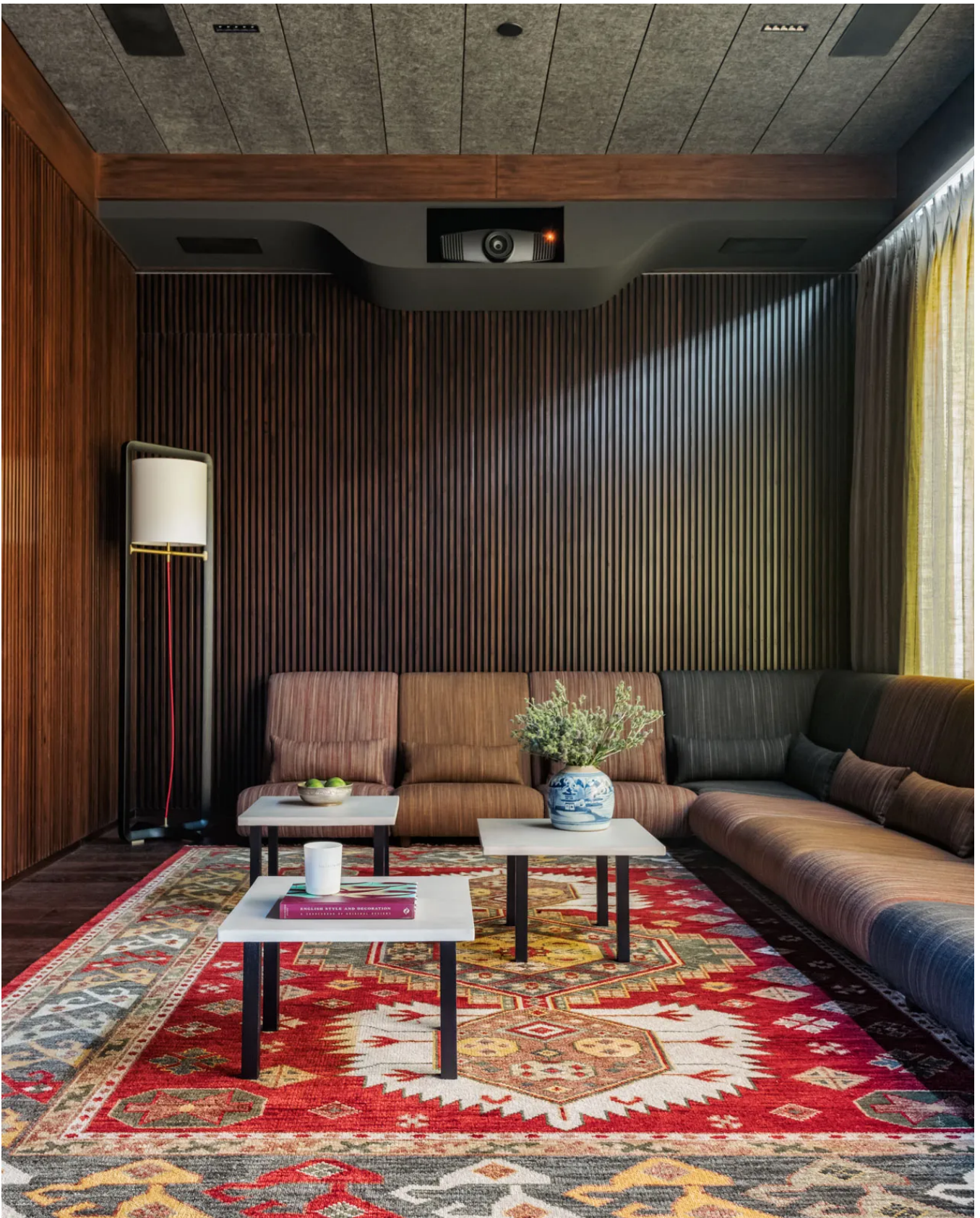
A vibrant carpet by Jaipur Rugs ties the entire home theatre together, while a simple floor lamp by Poltrona Frau creates ambient lighting in the room.

While the double-height ceiled family room and formal living room have striking styles, a keener eye will notice remarkably designed details that make the spaces more functional. To cover the niches in the family room's wall unit, Kiran designed a single sheet of glass spanning its breadth to move up and down with a