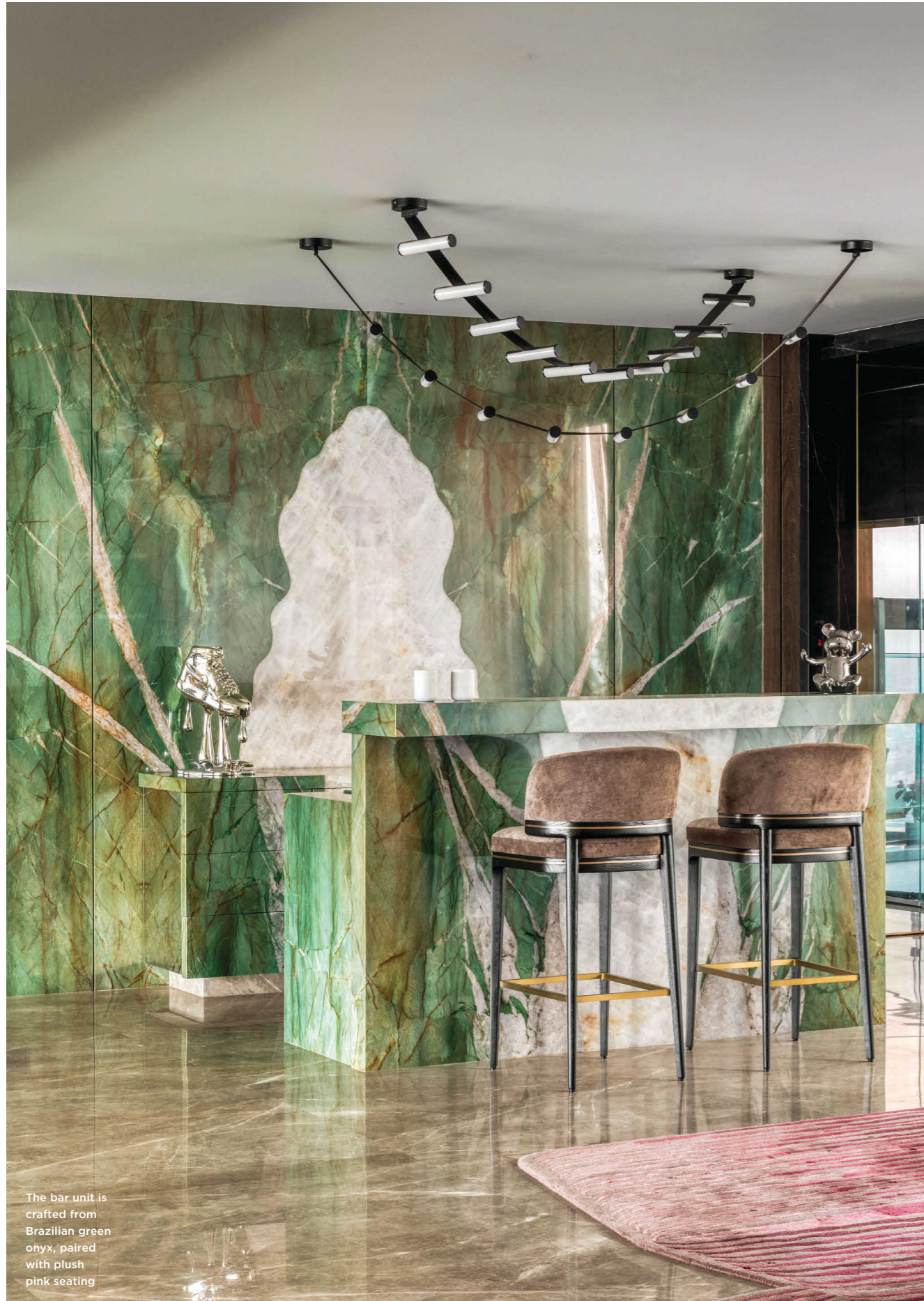
The bar unit is crafted from Brazilian green onyx, paired with plush pink seating