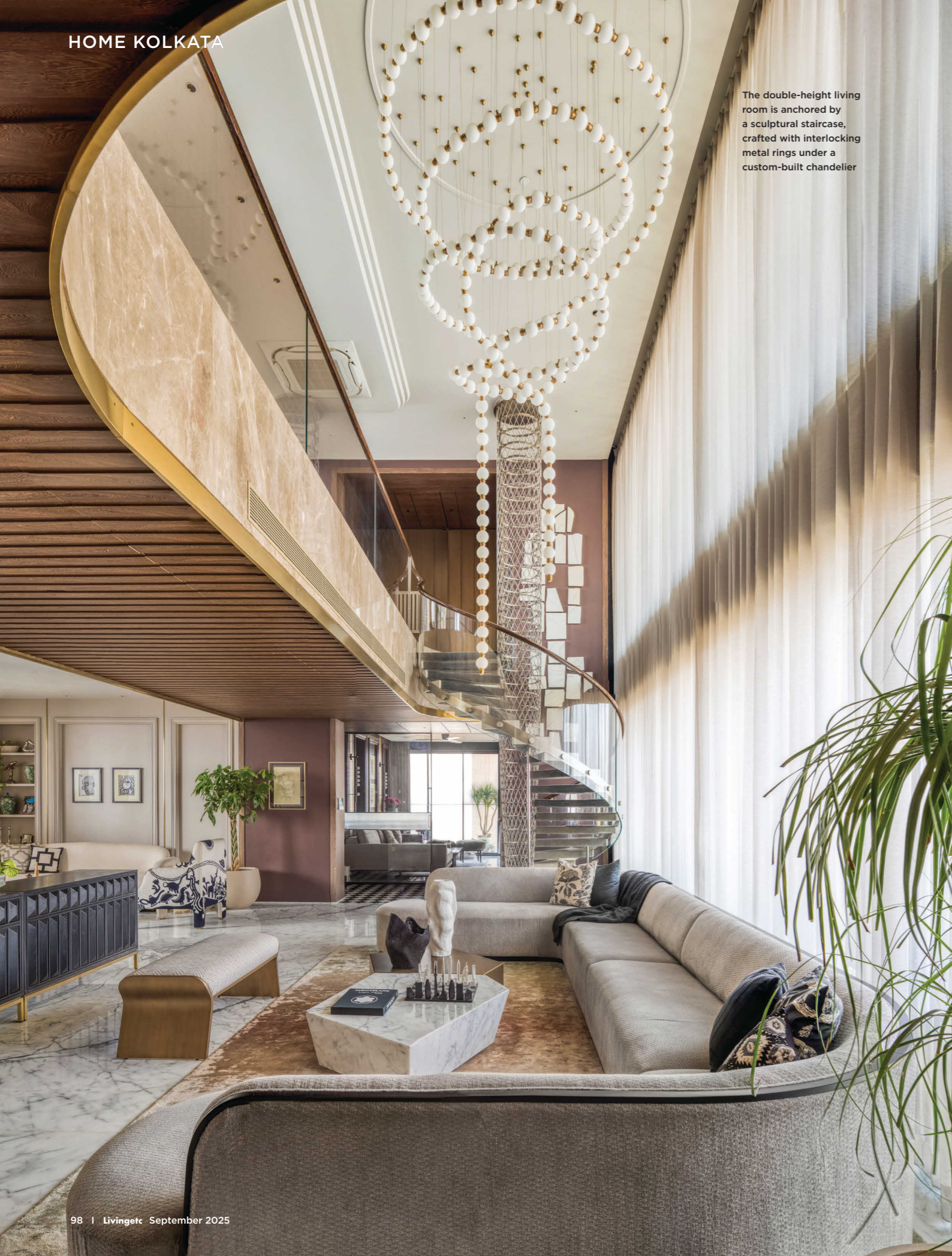
The double-height living room is anchored by a sculptural staircase, crafted with interlocking metal rings under a custom-built chandelier