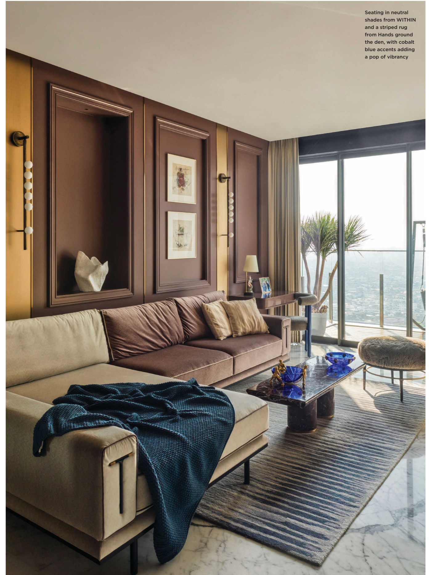
Seating in neutral shades from WITHIN and a striped rug from Hands ground the den, with cobalt blue accents adding a pop of vibrancy