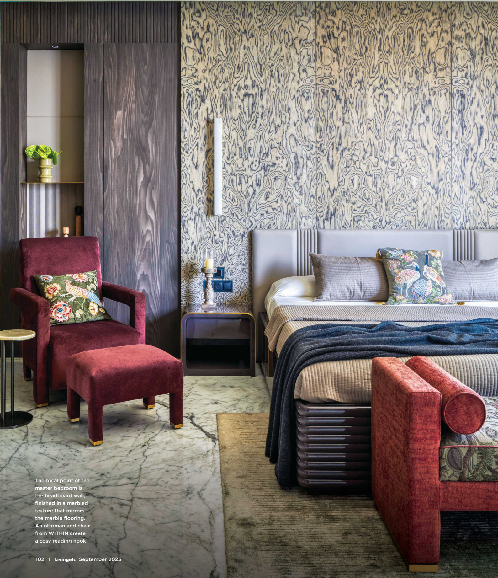
The focal point of the master bedroom is the headboard wall, finished in a marbled texture that mirrors the marble flooring. An ottoman and chair from WITHIN create a cosy reading nook